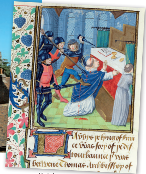
Knights killing Thomas Becket.