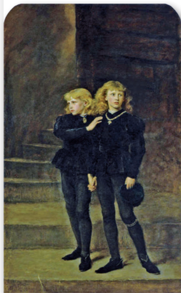
The Princes in the Tower, painting by John Everett Millais, 1878.