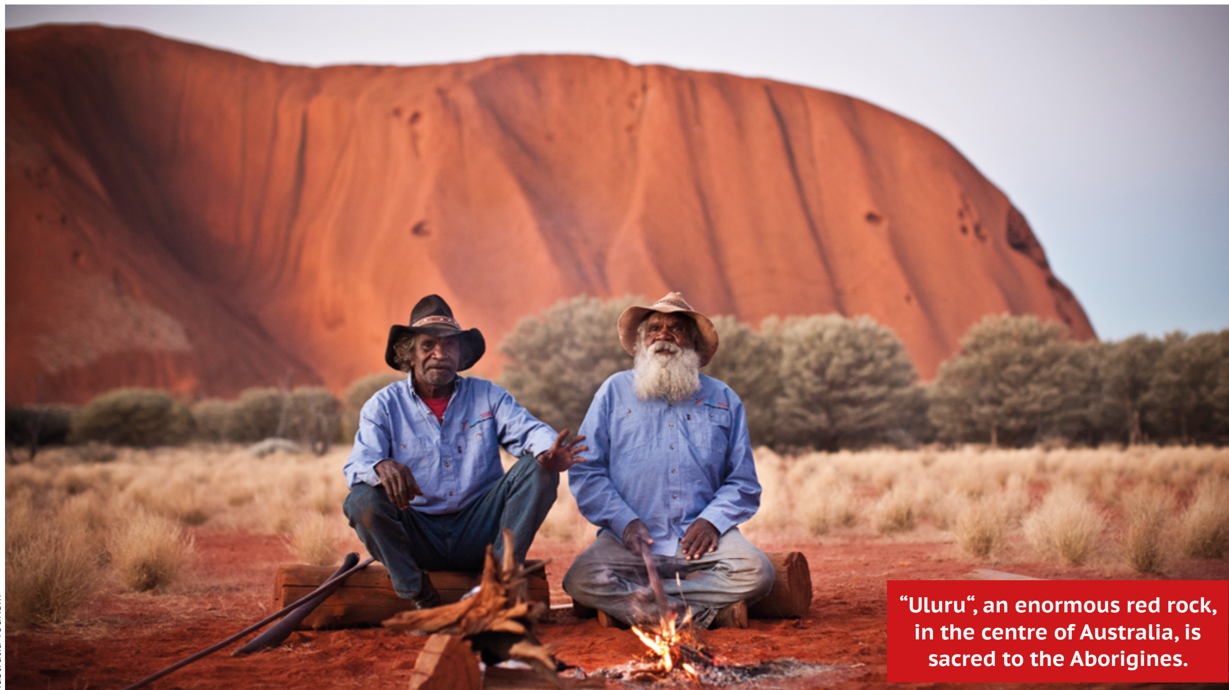
“Uluru”, an enormous red rock, in the centre of Australia, is sacred to the Aborigines.