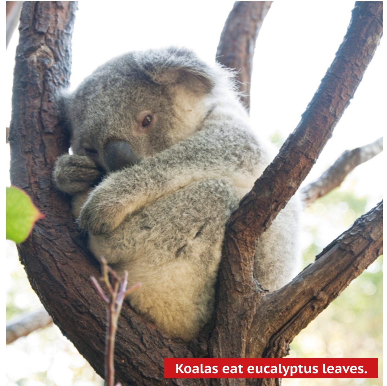
Koalas eat eucalyptus leaves.