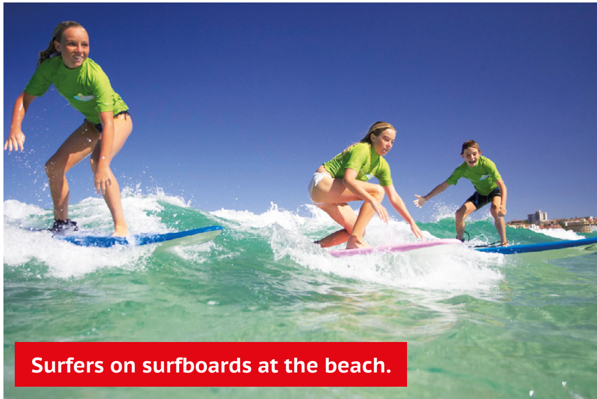
Surfers on surfboards at the beach.

The majority of the population live in cities near the ocean, not in the centre!