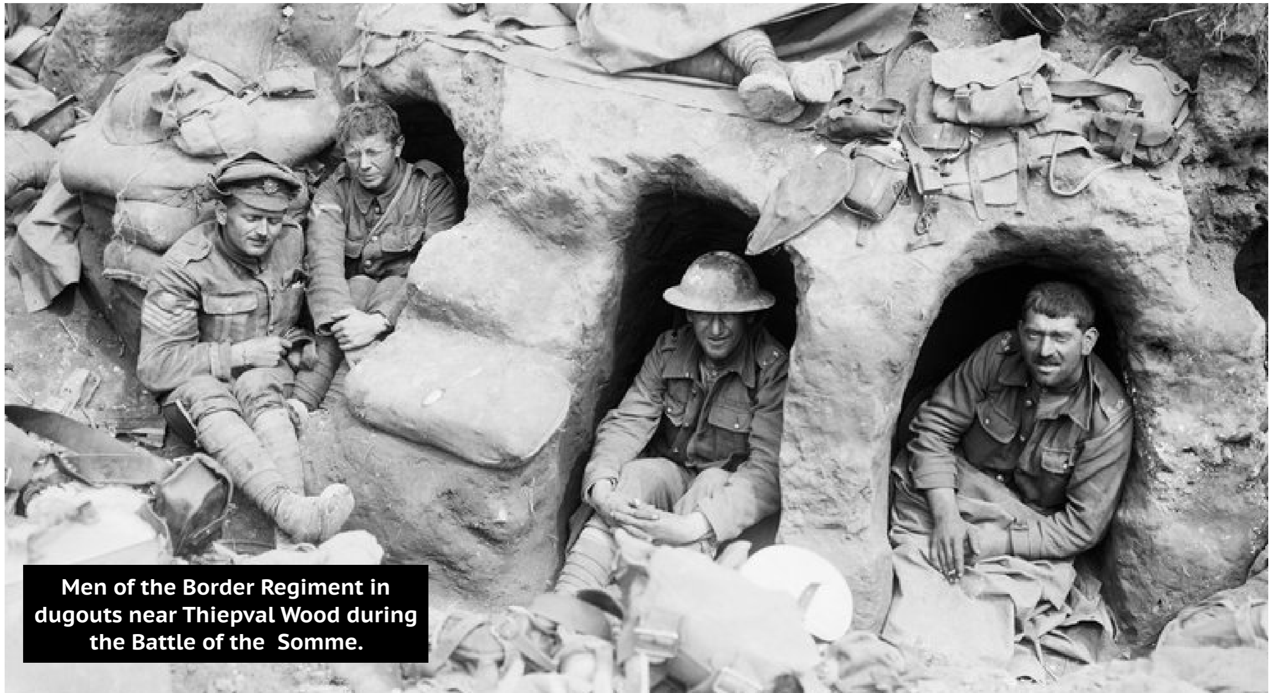
Men of the Border Regiment in dugouts near Thiepval Wood during the Battle of the Somme.