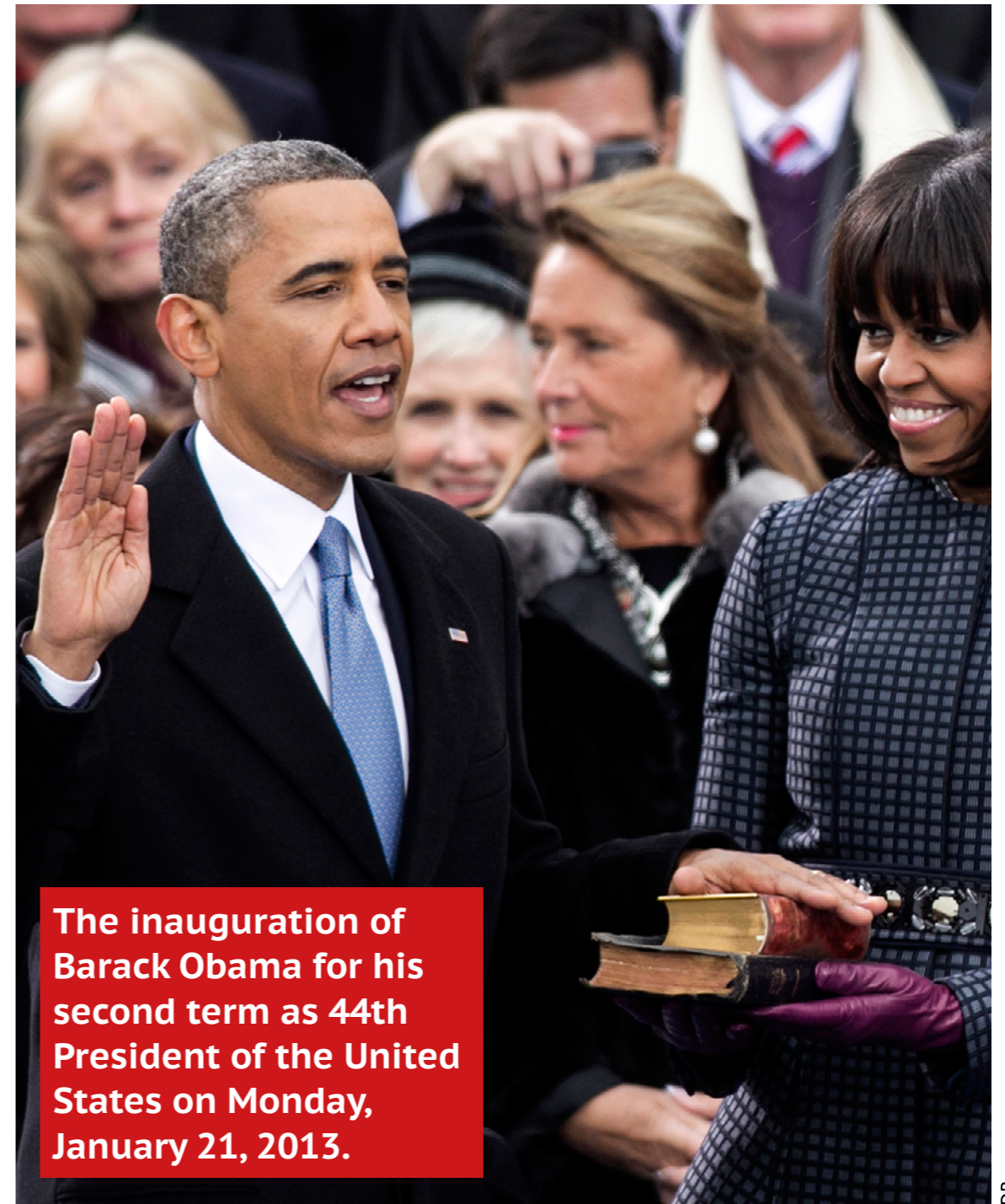
The inauguration of Barack Obama for his second term as 44th President of the United States on Monday, January 21, 2013.

electoral college (n, U.S.) a group of people whose role is to represent their states' votes for the President.