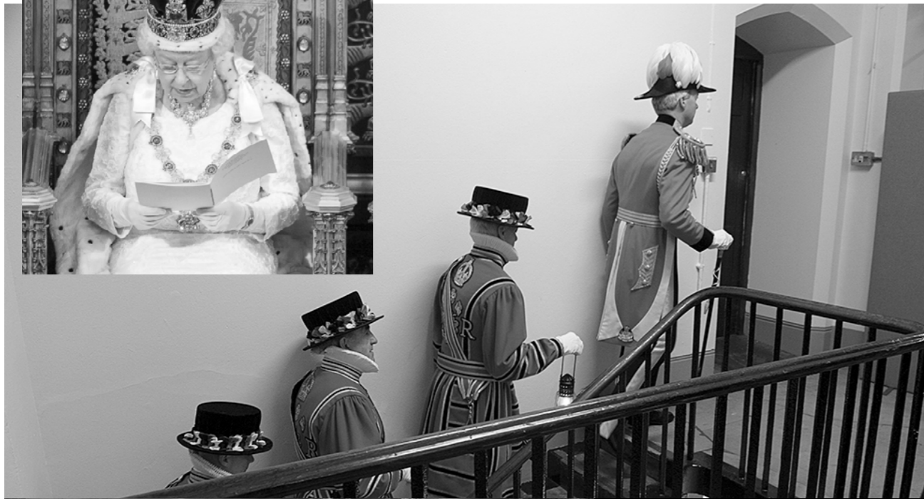
The Yeomen of the Guard (also called Beefeaters) are the monarch's bodyguards.