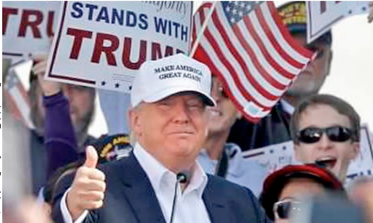
Donald J Trump for President

On 8 November 2016, Donald J. Trump won the election for the 45th President of the United States of America. He will be inaugurated in January. Who is President Trump?