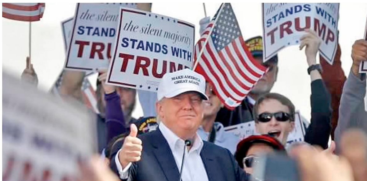
Donald J Trump for President

country? In the election he promised to invest money in infrastructure: building hospitals, schools and roads. He wants to reduce taxes and limit immigration. He has talked about building a wall on the 3200-km long border with Mexico, to stop illegal immigration. He has promised to encourage industry and jobs. And he wants to abandon the reforms President Obama initiated to give all Americans access to medical care and to protect the environment from climate change.