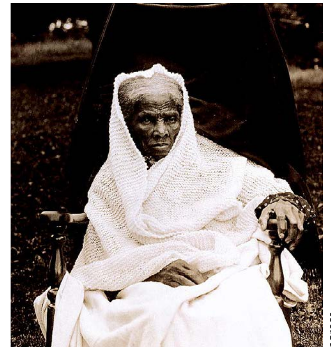
Harriet Tubman at the end of her life

Women on 20s asked Americans to choose a woman to put on the bill. More than a half a million people voted on the Internet. They chose Harriet Tubman. She was an exceptionally courageous person. She was born a slave in 1822, and after she escaped from slavery, she risked her life many times by returning to the South to help other slaves escape.