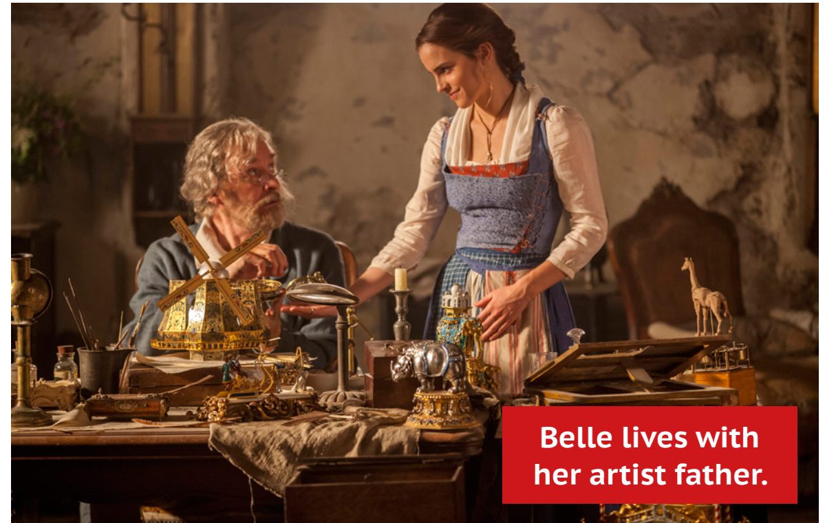
Belle lives with her artist father.

Emma Watson played Hermione Granger in all the Harry Potter films. Now she has participated in another favourite story from her childhood: the Disney film. “I have loved Beauty and the Beast since I was four years old,” she says, “Belle was this feisty young woman who had ambitions and was incredibly independent and wanted to see the world.”