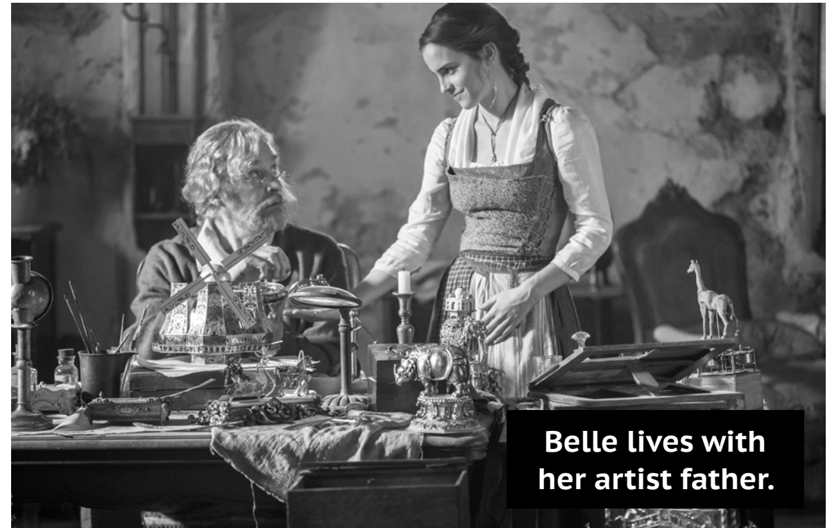
Belle lives with her artist father.

Emma Watson played Hermione Granger in all the Harry Potter films. Now she has participated in another favourite story from her childhood: the Disney film. “I have loved Beauty and the Beast since I was four years old,” she says, “Belle was this feisty young woman who had ambitions and was incredibly independent and wanted to see the world.”