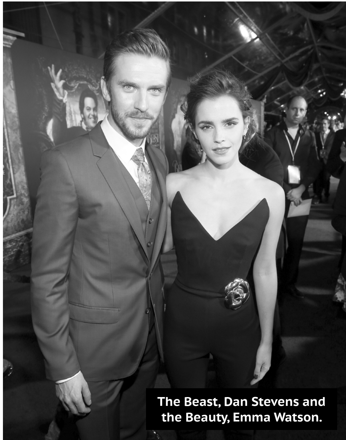
The Beast, Dan Stevens and the Beauty, Emma Watson.