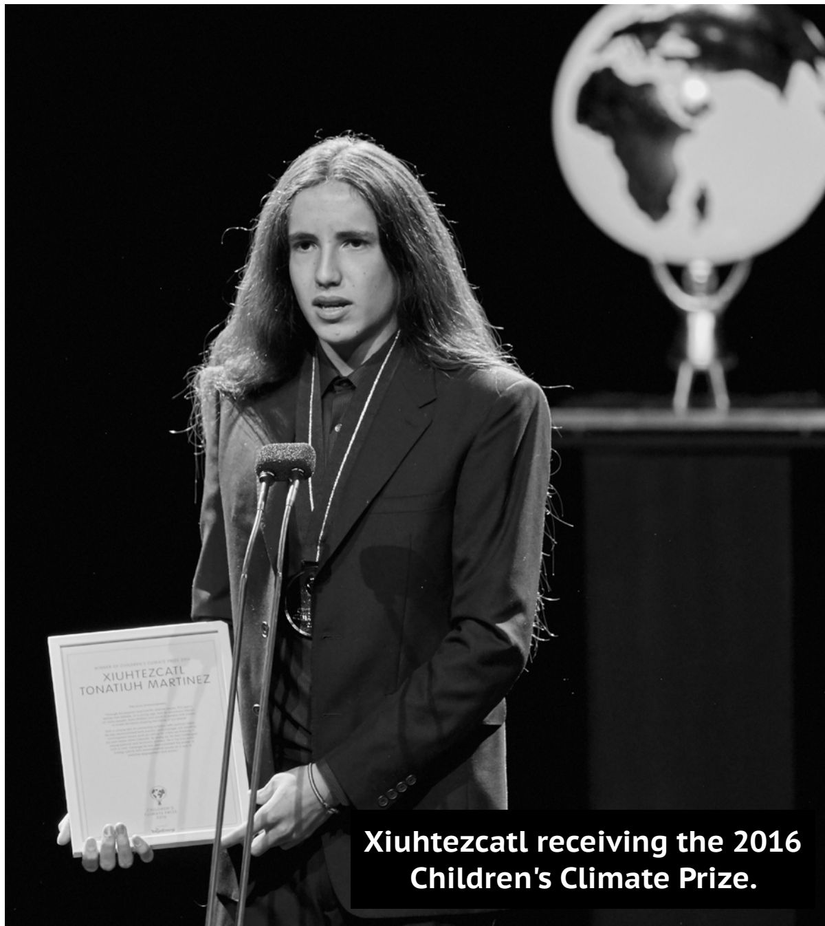
Xiuhtezcatl receiving the 2016 Children's Climate Prize.

get involved (v) participate in, take an interest in