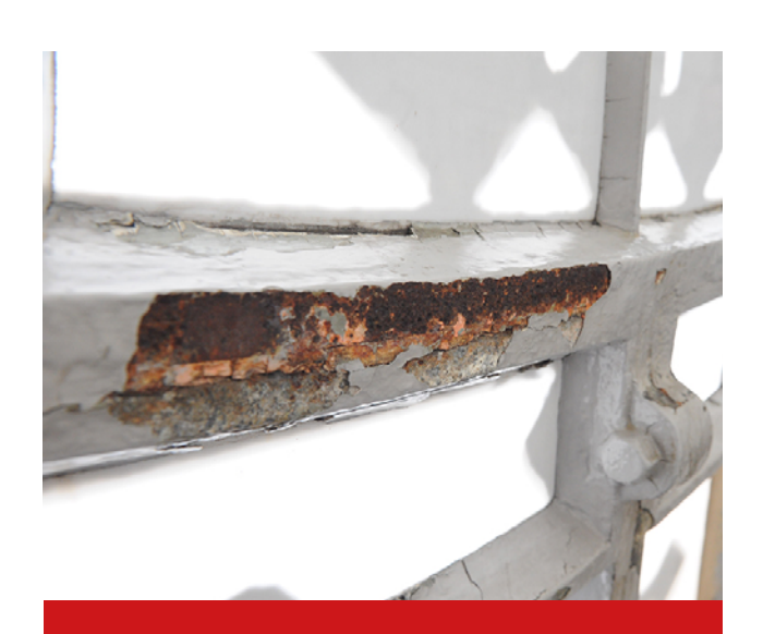
The metal-and-glass clock faces need repairs.

The Big Ben bell will stop ringing for part of the time. But for important occasions, Londoners will hear the sound of Big Ben as usual. ■