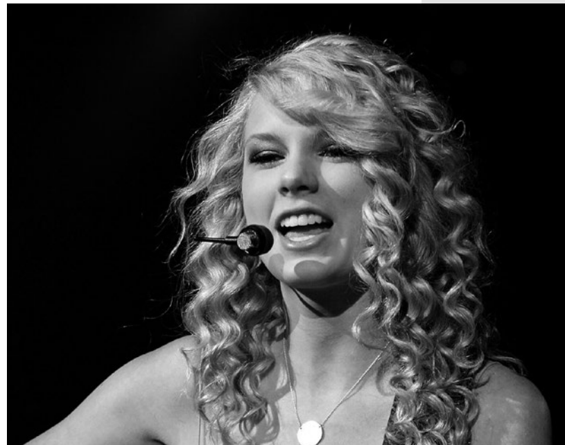
Taylor in 2011, and in 2017.

In 2014, she made her fifth album, 1989 . Then, she decided to have a break from music. In August 2017, Taylor suddenly deleted all her social media accounts: Facebook, Twitter, Tumblr and Instagram. Her official website disappeared too. Then, five days later, Taylor opened the accounts again and announced a new single, and a new album for November: Reputation .