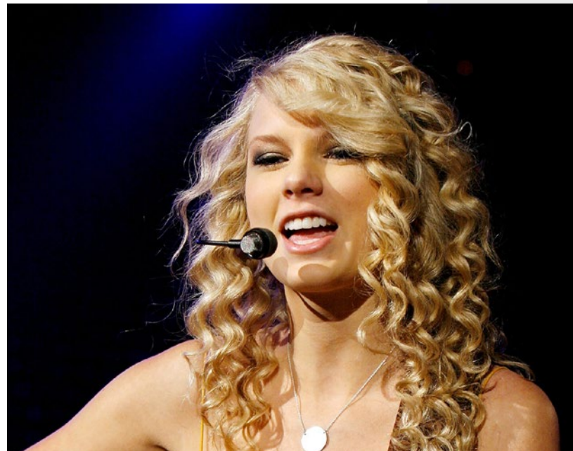
Taylor in 2011, and in 2017.

In 2014, she made her fifth album, 1989 . Then, she decided to have a break from music. In August 2017, Taylor suddenly deleted all her social media accounts: Facebook, Twitter, Tumblr and Instagram. Her official website disappeared too. Then, five days later, Taylor opened the accounts again and announced a new single, and a new album for November: Reputation .