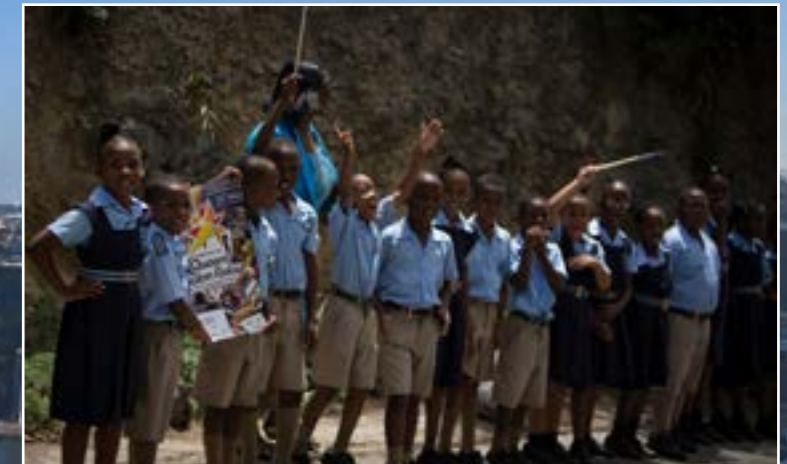
Schoolchildren waiting to see the Baton in Barbados, in the Caribbean.

The Queen's Baton Relay visits all 70 countries and territories participating in the Games. It started from Buckingham Palace on 13 March 2017: Commonwealth Day. It has a message from the Queen. It arrived in Australia on Christmas Day, 2017, then visited 100 communities in the country. Australian Commonwealth and Olympic swimming champion Ian Thorpe carried the torch up Sydney Harbor Bridge.