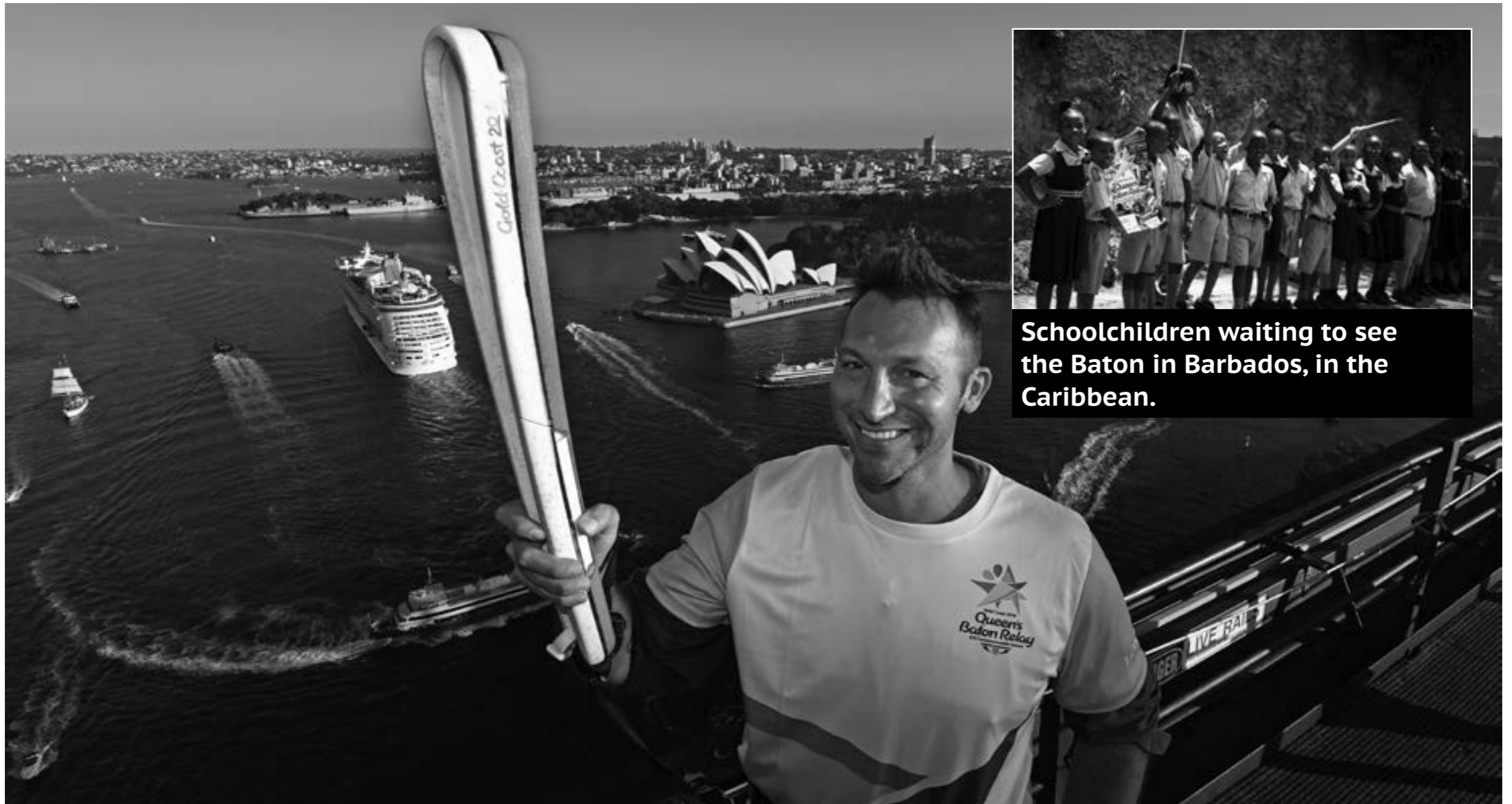
Schoolchildren waiting to see the Baton in Barbados, in the Caribbean.

The Queen's Baton Relay visits all 70 countries and territories participating in the Games. It started from Buckingham Palace on 13 March 2017: Commonwealth Day. It has a message from the Queen. It arrived in Australia on Christmas Day, 2017, then visited 100 communities in the country. Australian Commonwealth and Olympic swimming champion Ian Thorpe carried the torch up Sydney Harbor Bridge.