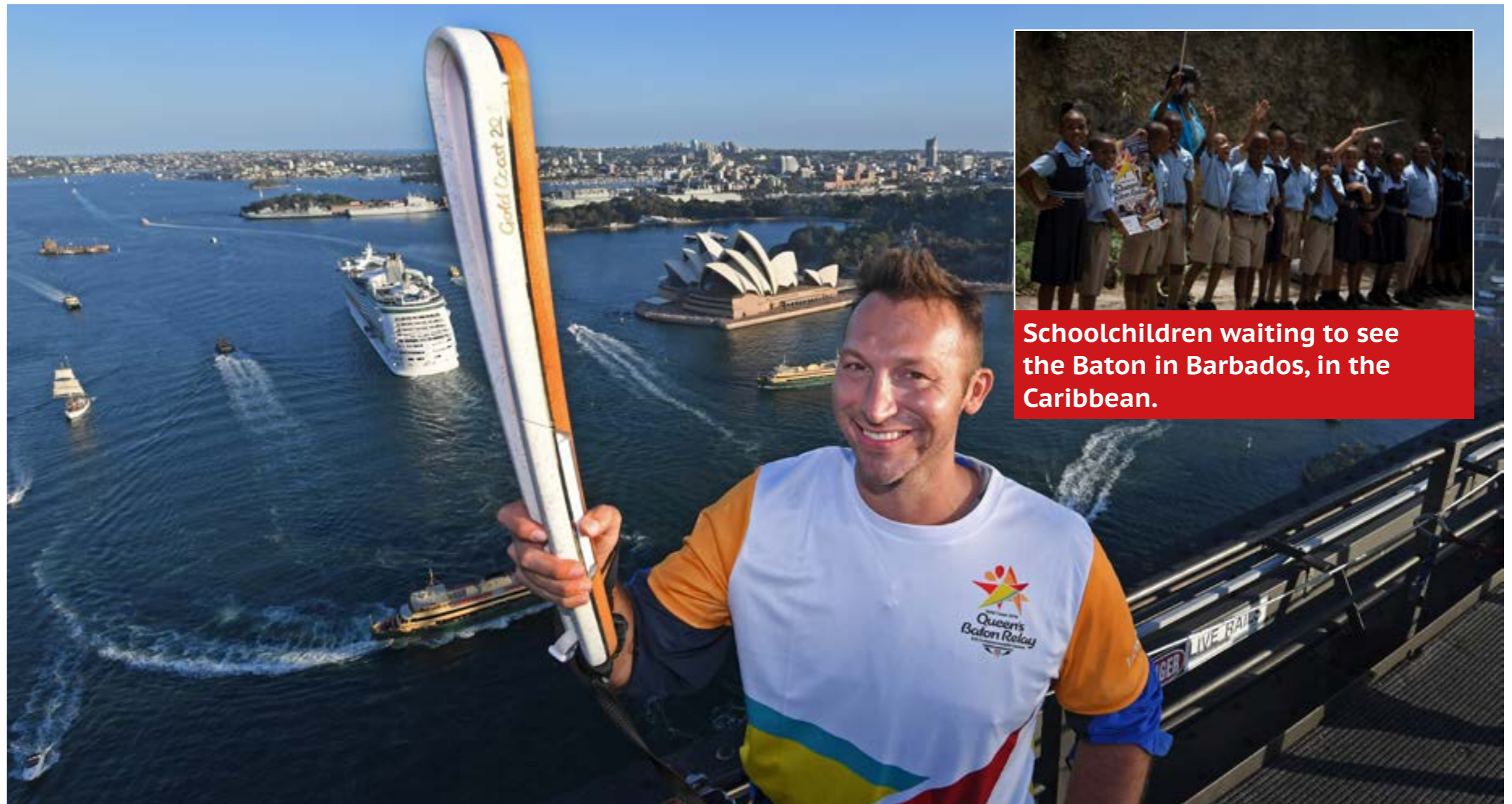
Schoolchildren waiting to see the Baton in Barbados, in the Caribbean.

The Queen's Baton Relay visits all 70 countries and territories participating in the Games. It started from Buckingham Palace on 13 March 2017: Commonwealth Day. It has a message from the Queen. It arrived in Australia on Christmas Day, 2017, then visited 100 communities in the country. Australian Commonwealth and Olympic swimming champion Ian Thorpe carried the torch up Sydney Harbor Bridge.