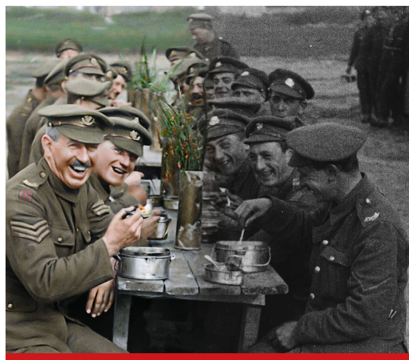
The new version of the image... and the original.

The result is amazing. The soldiers appear incredibly real. You have the impression you could touch them and talk to them. As Jackson says, "They didn't see the war in black and white. They saw the war in colour." And now we can too.