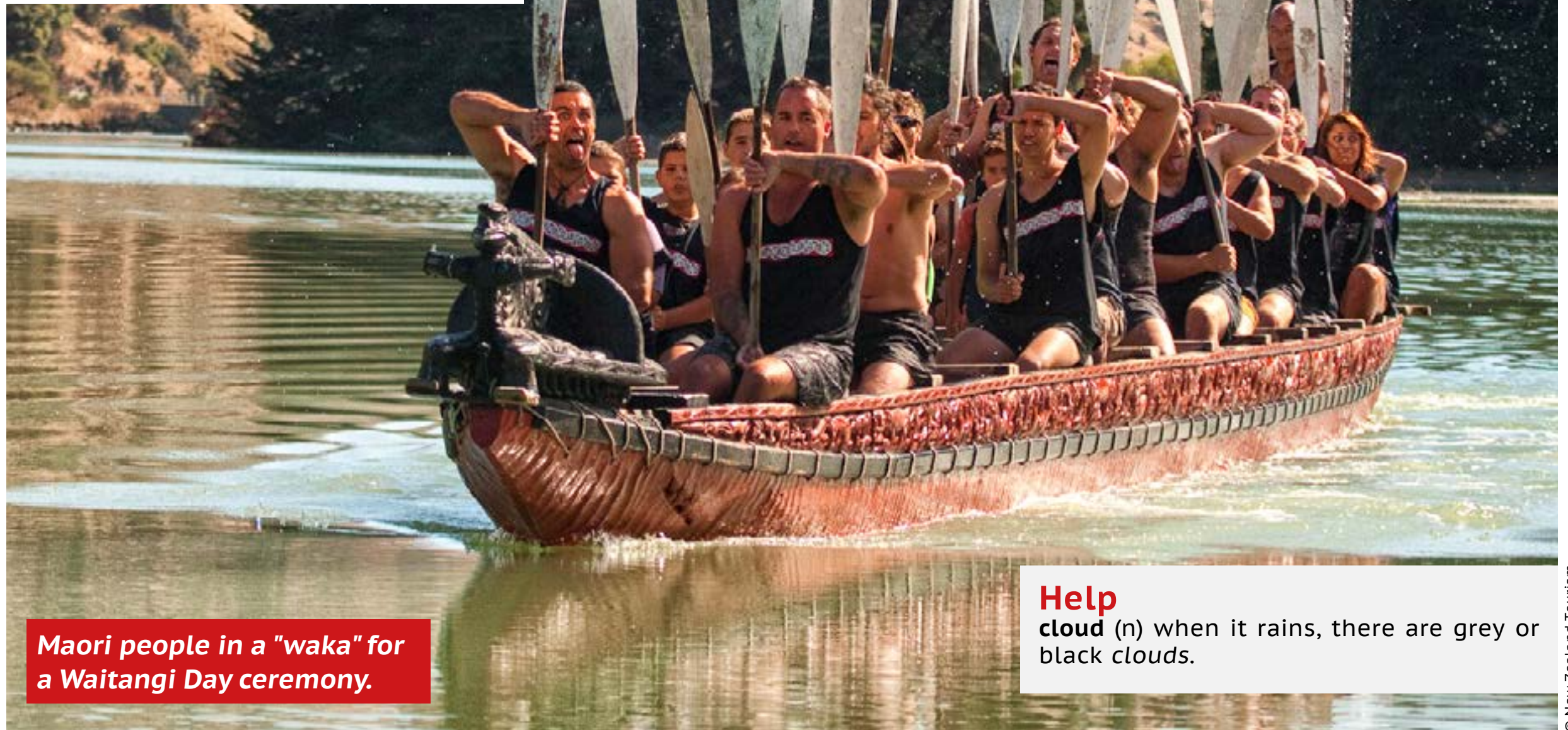
Maori people in a "waka" for a Waitangi Day ceremony.

Fifteen percent of the population is Maori. The Maori arrived in waka (large canoes) from Polynesia about 1,000 years ago. The Maori name for the country is Aotearoa, which means "the Land of the Long White Cloud."