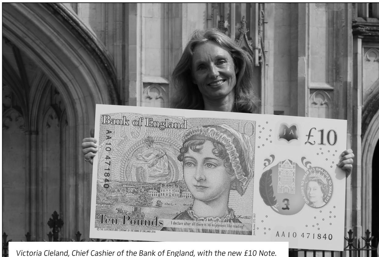
Victoria Cleland, Chief Cashier of the Bank of England, with the new £10 Note.