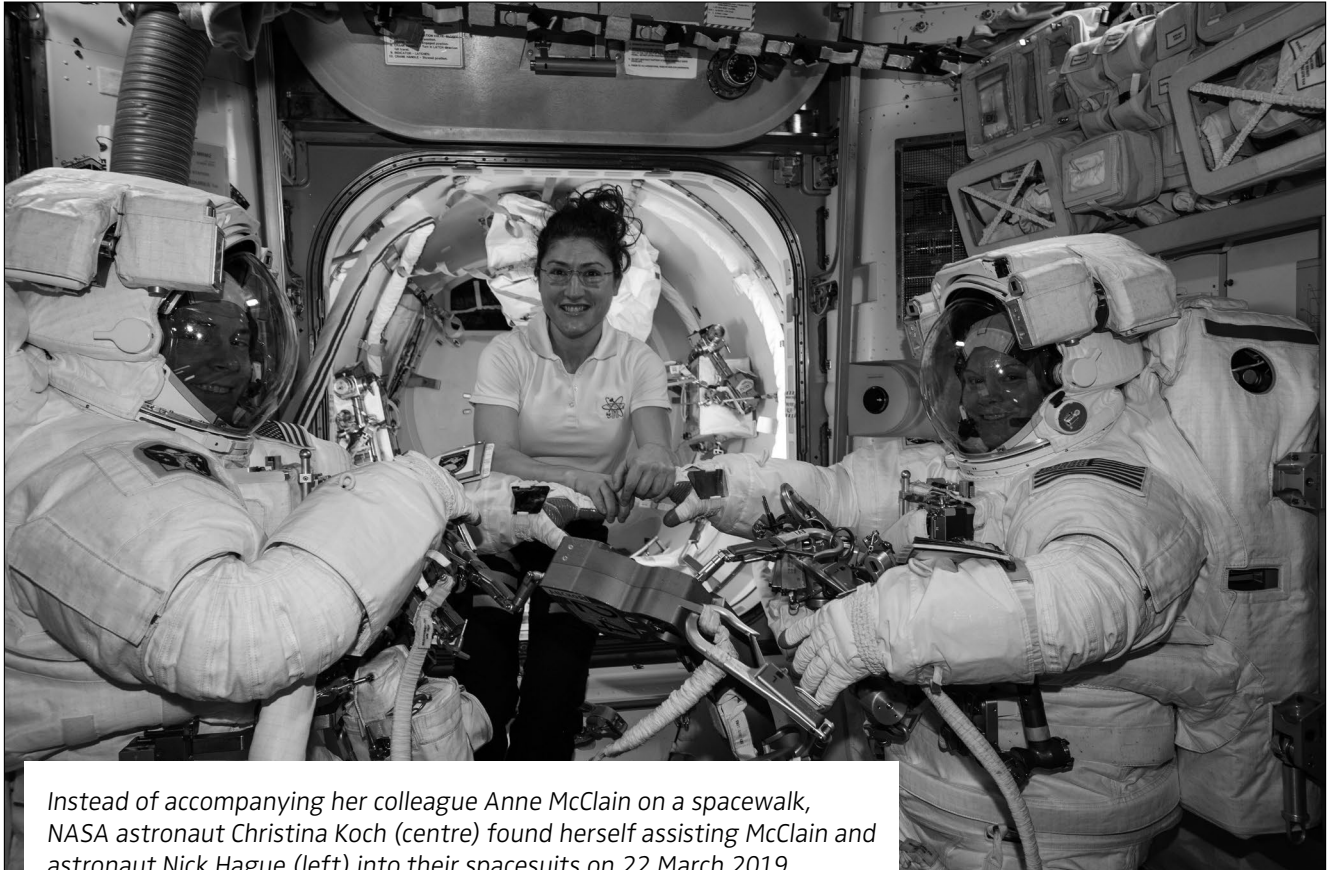
Instead of accompanying her colleague Anne McClain on a spacewalk, NASA astronaut Christina Koch (centre) found herself assisting McClain and astronaut Nick Hague (left) into their spacesuits on 22 March 2019.