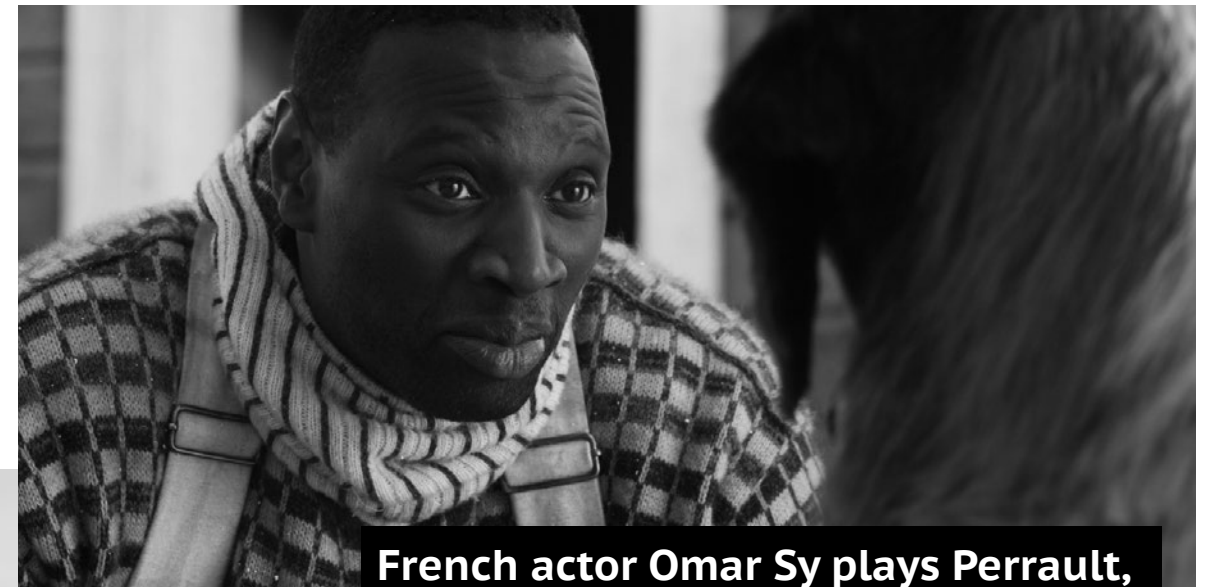
French actor Omar Sy plays Perrault, a French Canadian who is kind to Buck when he works with him.

Prospectors found gold in the Klondike River, in the Yukon region of Canada, in 1896. 100,000 people travelled the isolated region but very few got rich.